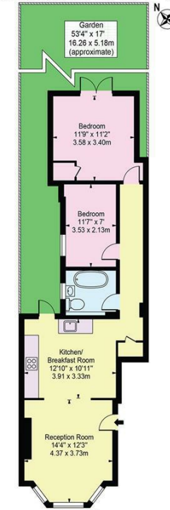
Ground Floor For Illustration Purposes Only - Not To Scale

Hazelwood Lane, Palmers Green, N13 5HB Approx. Gross Internal Area 669 Sq Ft - 62.12 Sq M